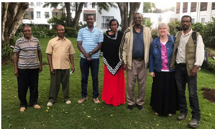
The Dispensary Board