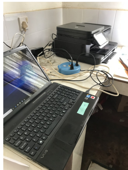
Donated computer and printer installed in the front office.