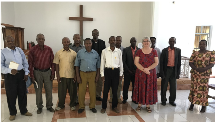
The Ndoombo Parish Elders