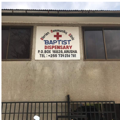
Left: Baptist Dispensary in Arusha