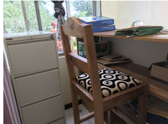
A locking file cabinet was purchased.

Many of you contributed towards our need to secure patient records and fulfill reporting requirements. This has been accomplished by upgrading technology and office space—thank you!!