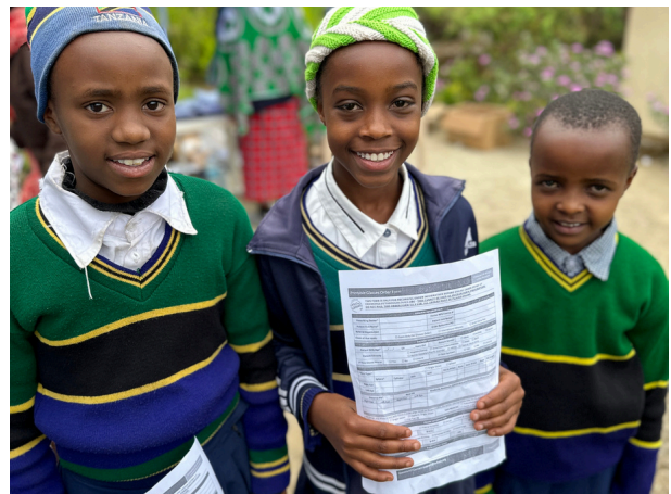
Students after getting their eye exams.