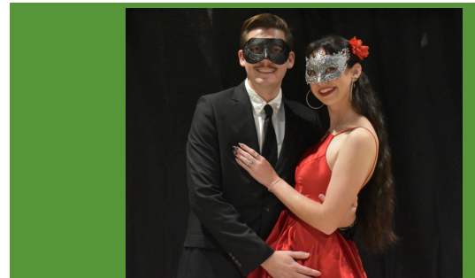
Guests at the Masquerade Gala

REFLECTION: A MASQUERADE GALA FINANCIAL REPORT