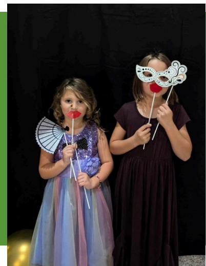
Masquerade guests enjoying the photo booth.