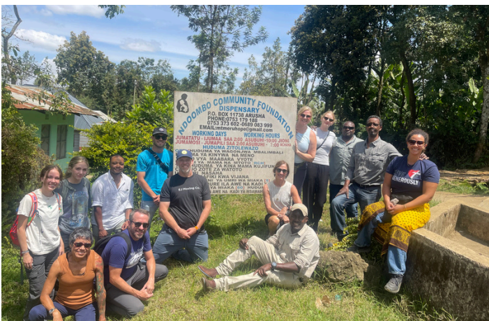
Volunteers on the second VHI eye clinic 2024

The Ndoombo Dispensary's mission is to improve the quality of life for all in this community by providing a variety of healthcare services. The dispensary is equipped to provide both preventative care and accept all walk-in patients with medical needs. Volunteering at the Dispensary inspired me and instilled an idea of what international medicine looks like and what the needs are. As a pre-medical student, I aim to become a physician. My time at the Dispensary has had a tremendous impact on me and my perspective on what makes an incredible integrous healthcare provider.