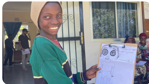
A drawing for Ava.