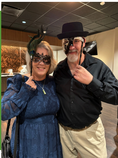
Masquerade guests showing off masks

Thank you to everyone who contributed to making this event an unforgettable success. We are incredibly thankful for the generosity of everyone who helped us raise just under $6,500! As we look to the future, we're filled with optimism. The success of this year's fundraiser not only strengthens our resolve but also reminds us of the powerful impact of community collaboration. Together, we're not just expanding a clinic and creating opportunities; we're building hope for healthier communities. Thank you again for being part of this journey. We look forward to continuing our mission with your invaluable support and sharing future successes with you.