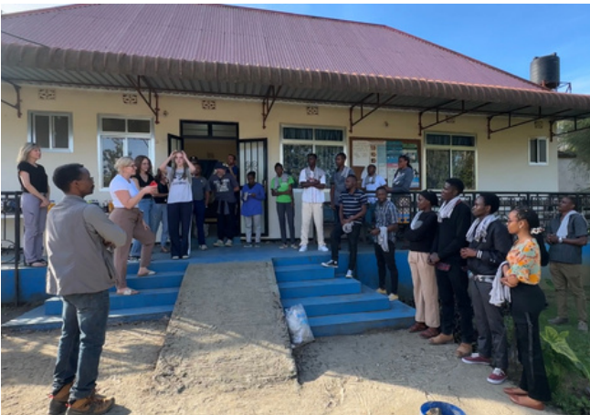
Group leaders at the end of the week celebration. Giving a special thank you to the volunteers and translators for their hard work.

Moments like those were in abundance. Gratitude encapsulated the whole experience. The entire team of volunteers, doctors, translators, staff worked in unison to accomplish the joint mission of providing quality care. The VHI and Ndoombo Community Dispensary collaboration captures the strength of transnational teamwork, and the impact transformational eye care has in local communities.